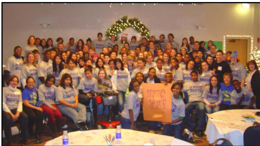
Group photo from the 2009 HOUSE Retreat

In 2009, West High introduced the first off-site, day long "Retreat." Over 120 students and teachers were involved in learning communication skills at many levels. The Class of '61 was the main sponsor, donating $2500 in support. The results and feedback were incredible.