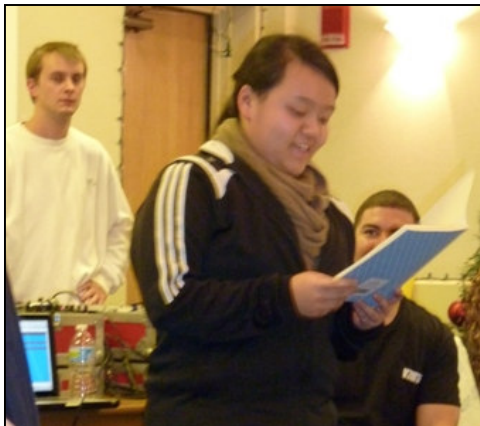
Original poetry reading from one of the group activities. Schooling vs Education.

His objective was to teach students how to use their voices for power as well as artistic means (art/song/dance/writing) to create positive environments. The Class of '61 again was the main sponsor and contributed $5000.