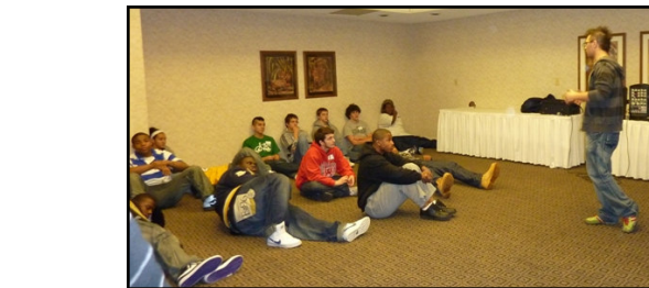
Students gather to discuss their projects.

Total contributions to date have been $28,500 with project funding of $16,810. Ninety (90) Class alumni as well as the Rotary and Kiwanis clubs have participated with donations with several alumni giving of their time to meet with West High staff and students. The funds are now administered by the Foundation for Madison Public Schools. The interest earned by these funds goes to the FMPS.