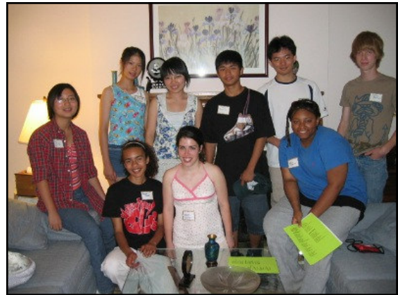
Everytown delegates July 2006 -07

The thought at the time was to fund programs not available to students through the school, yet important to their personal development. Through alumni suggestions, the focus became providing training in leadership, diversity and communication skills which would contribute to building positive foundations for students in their community.